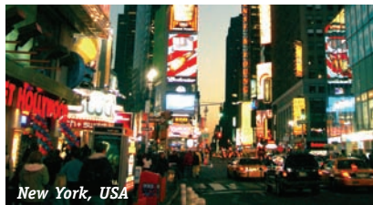
New York, USA